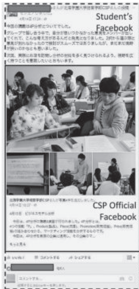
Figure 3. A Student’s Facebook Page

Students can add a sentence to the status shared on their Facebook page. They can share statuses on the CSP Official Facebook page. Hence, adding sentences enables students to generate their own “Reflective Journals.” The arrow line from “(1) Portfolios” to “(2) Reflective Journals” in figure 2 shows this